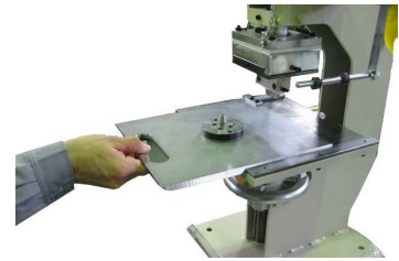
Special designed jig